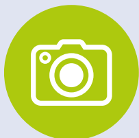
Image & Video Library

We've created a folder of images and videos that highlight our services, which you're welcome to use in your YPI presentation. You can also organise to visit our warehouse and take your own photos.